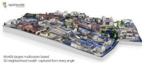
World's largest multi-copter based 3D neighborhood model - captured from every angle

Spotscale has produced a 3D model of a whole downtown area in unique sub-centimetre imagery resolution. NASA and Swedish researchers will use the model to study how unmanned aerial systems (UASs) will affect our urban environment and future air traffic control. The purpose of the project is to simulate how drone traffic will affect the regular flight traffic and the urban landscape in terms of landing areas, charging areas and other gathering places for the drones.